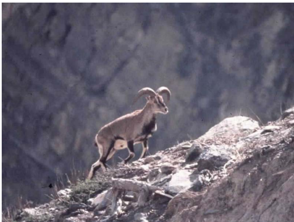
Blue sheep male in Hemis National Park