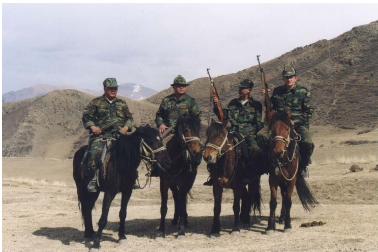
NABU anti-poaching team Gruppo Bars in Kyrgyzstan © Birga Dixel German Society for Nature Conservation - Naturschutzbund Deutschland