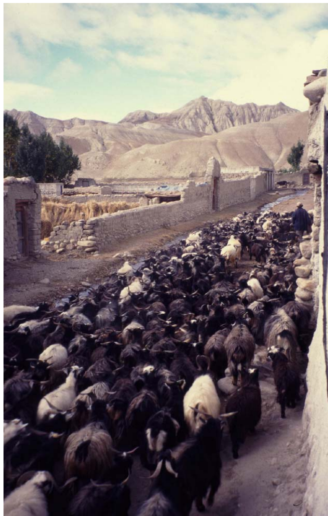
Villagers in Mustang, Nepal, depend upon their sheep and goats.