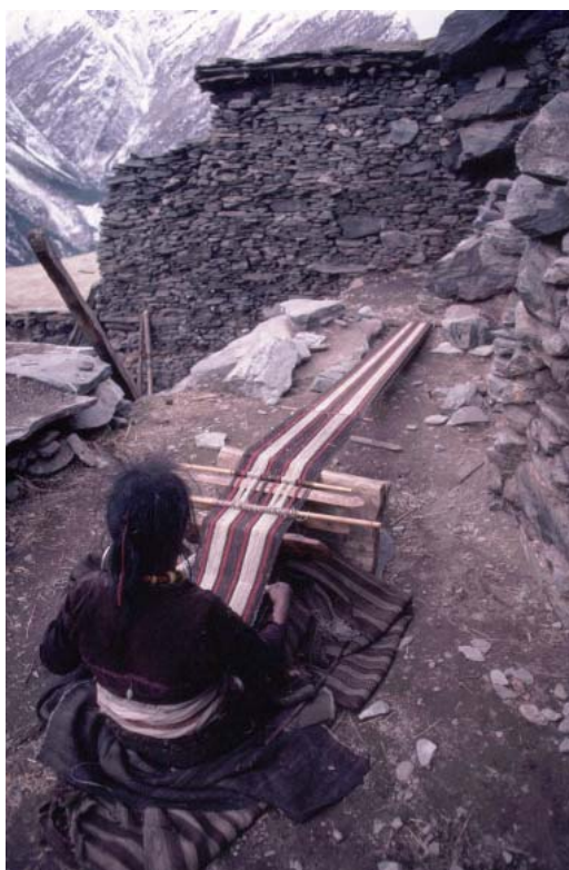
Weaving is a winter-time activity in Dolphu village, Nepal