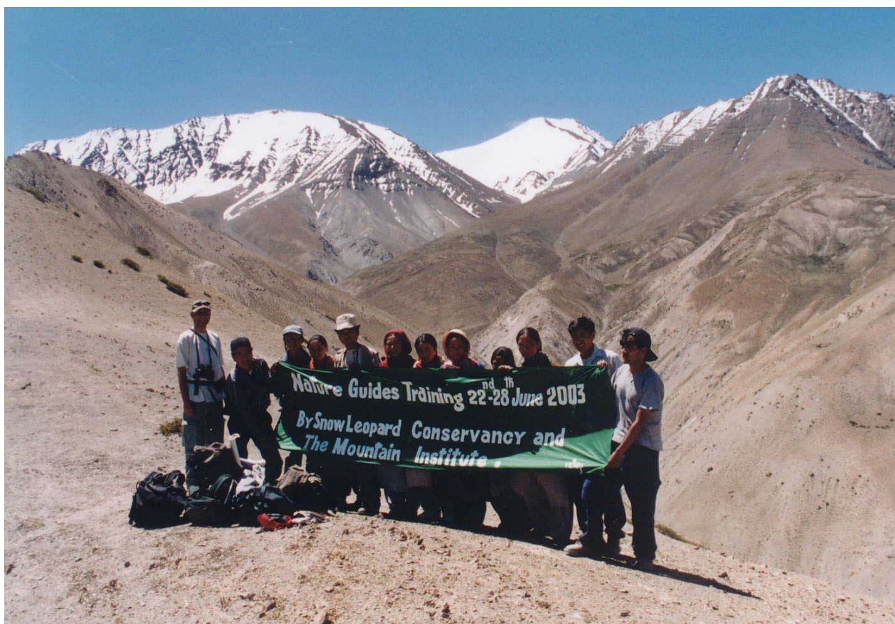
SLC-trained nature guides help bring direct benefits of ecotourism to their village.