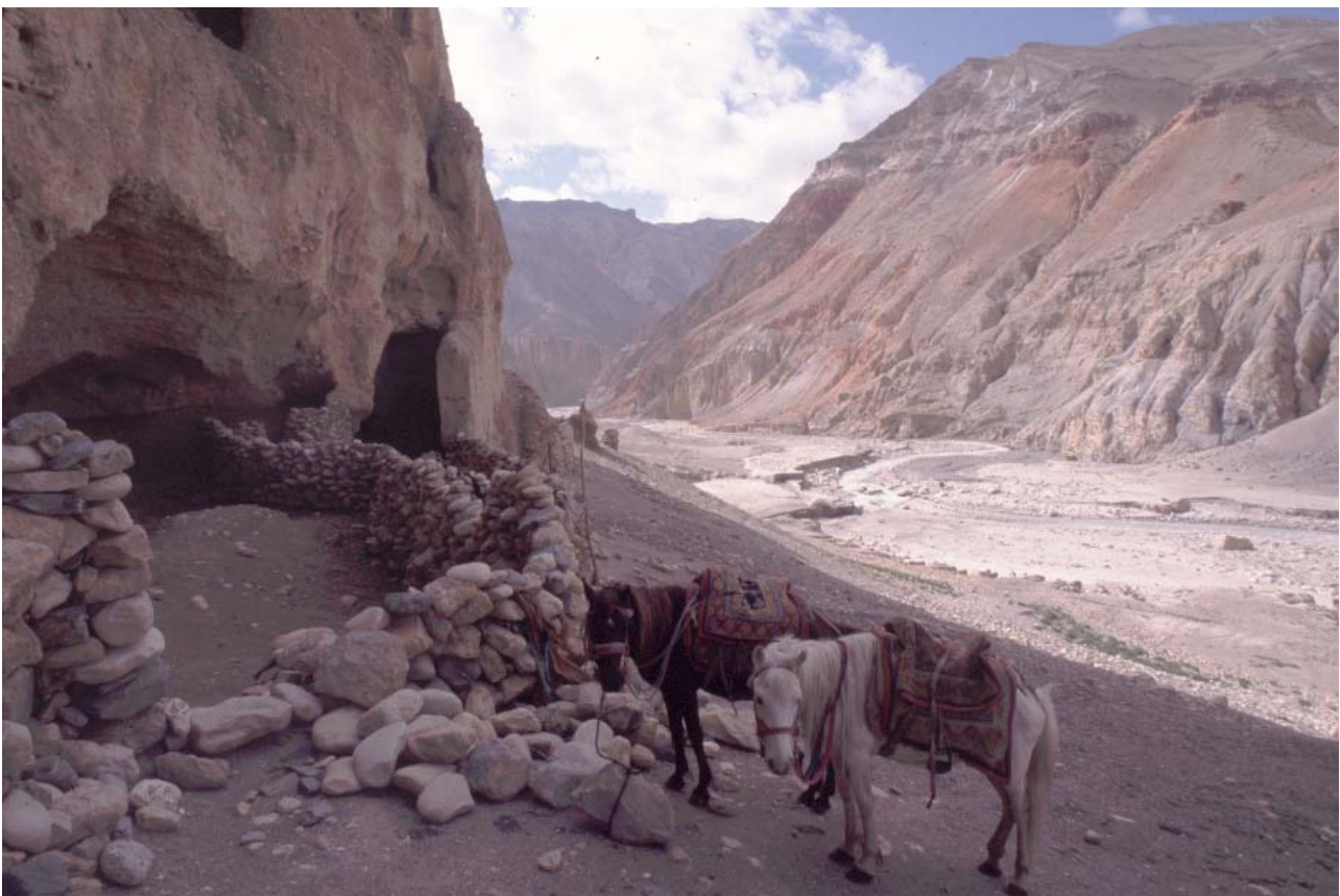
Typical corral in Mustang, Nepal, protecting livestock from predators.